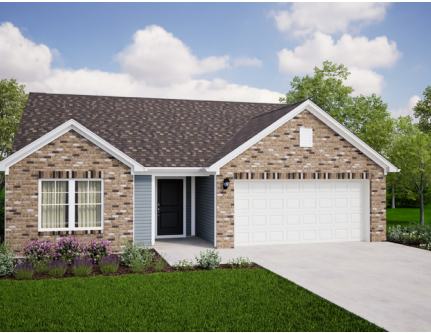
SHOWN WITH BRICK OPTION C