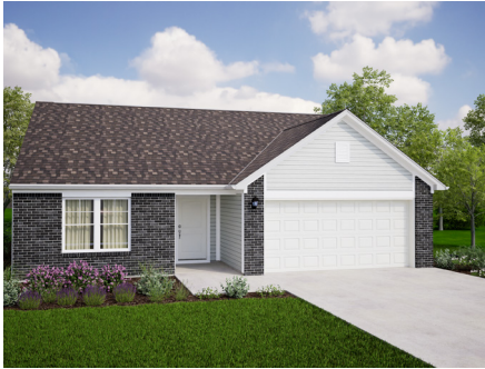
SHOWN WITH BRICK OPTION B