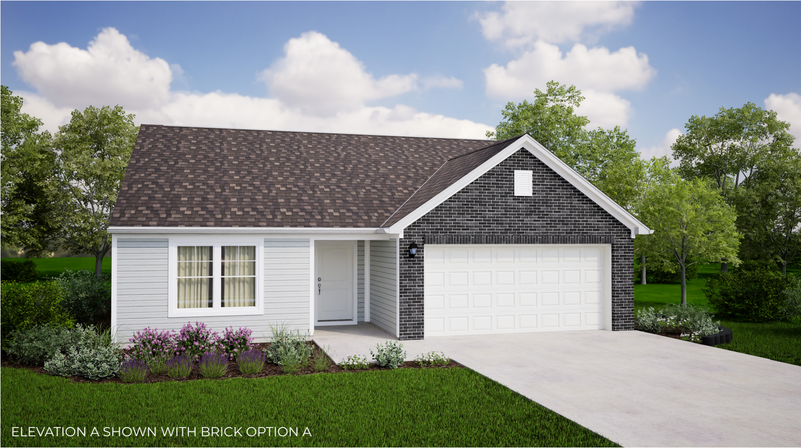
ELEVATION A SHOWN WITH BRICK OPTION A

1,228+ sq.ft. RANCH 3 BEDROOMS 2 BATHS 2 CAR GARAGE