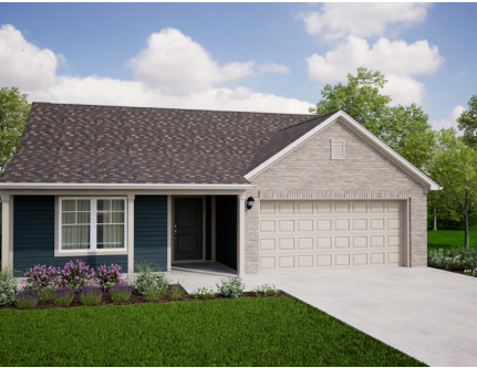
SHOWN WITH BRICK OPTION A