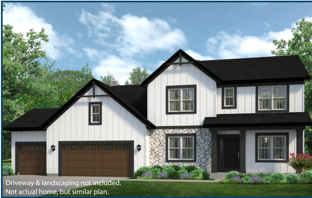
Driveway & landscaping not included. Not actual home, but similar plan.