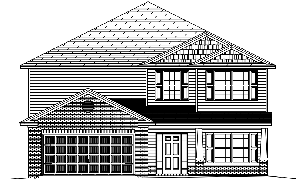
FRONT ELEVATION "C"