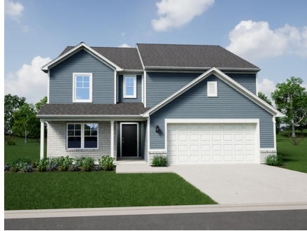
SHOWN WITH BRICK OPTION B