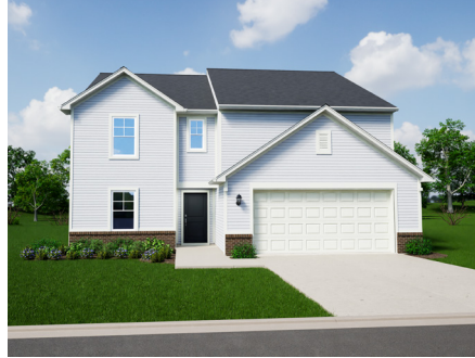
SHOWN WITH BRICK OPTION A