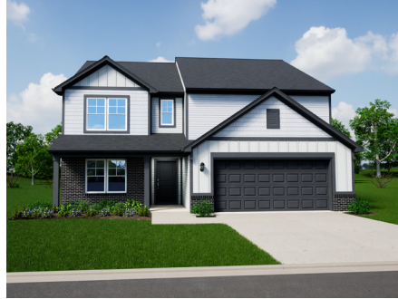
SHOWN WITH BRICK OPTION C