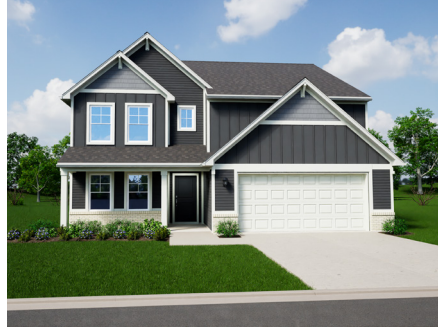
SHOWN WITH BRICK OPTION A