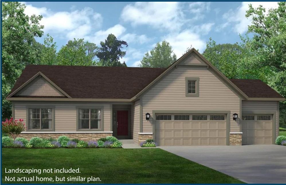
Landscaping not included. Not actual home, but similar plan.