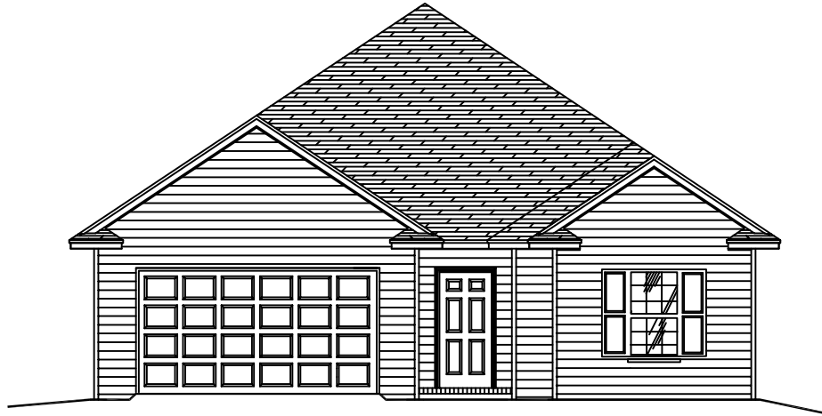
FRONT ELEVATION "A"

HEATED: 1,434 SQ. FT. UNDER ROOF: 1,820 SQ. FT. DEPTH: 53'-10" WIDTH: 38'-0"