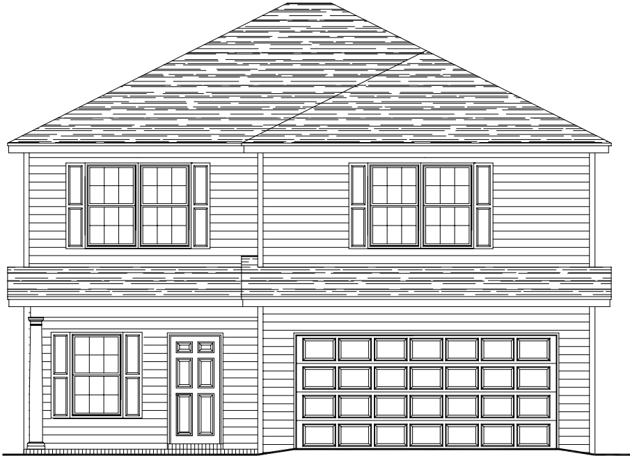
FRONT ELEVATION "A"

HEATED: 2,515 SQ. FT. UNDER ROOF: 2,944 SQ. FT. DEPTH: 54'8" WIDTH: 35'0"