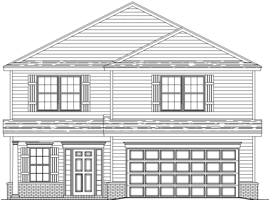
FRONT ELEVATION "D"

NOTE: GARAGE ORIENTATION DEPENDS ON COMMUNITY STANDARDS.