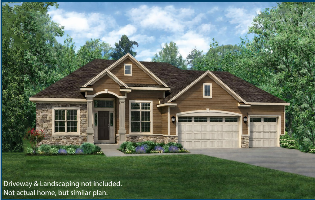
Driveway & Landscaping not included. Not actual home, but similar plan.