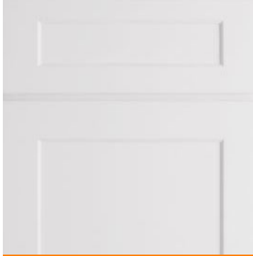
Cabinetry: Birch - White