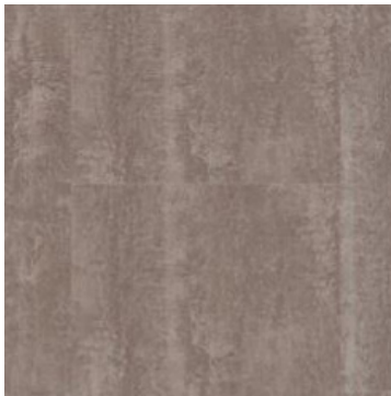
Bathroom Flooring: LVT - Quarry - Pisa