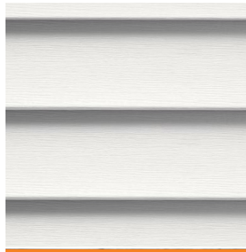
Exterior Corner Trim: White