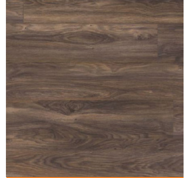
Flooring: InHaus Laminate - Gunstock Oak