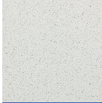
Kitchen Countertops: Quartz - Fresh Linen