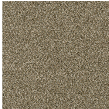
Carpet: Dwellings - Silver Birch

Home elevation renderings and color selection sample images are for illustration purpose only. Digital representation of colors may vary from the actual product. Price accurate as of 12/16/2025. Builder reserves the right to make changes without notice.