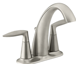
Bathroom Plumbing: Kohler Medley Vibrant Stainless