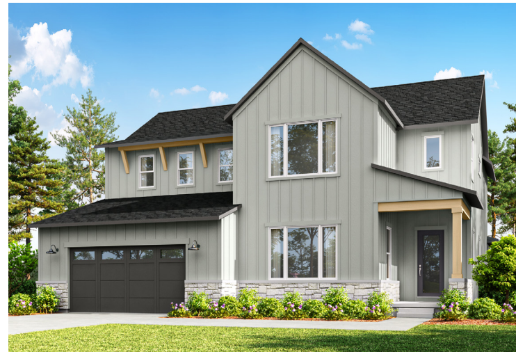
ELEVATION A (FARMHOUSE)

3,215 Sq. Ft. Finished Above Ground 1,522 Sq. Ft. Unfinished Basement 4-6 Bedrooms 3.5-4.5 Bathrooms 3-4 Car Garage