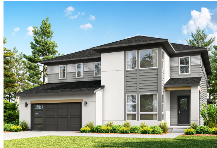
ELEVATION B (CONTEMPORARY)