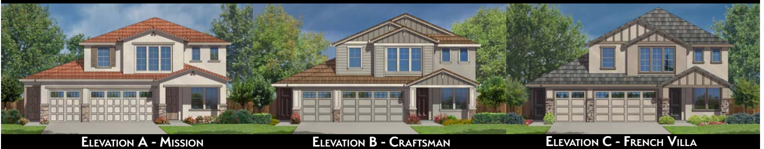
ELEVATION A - MISSION