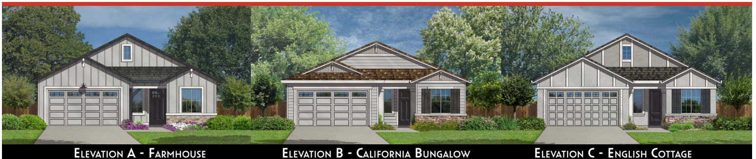
ELEVATION A - FARMHOUSE