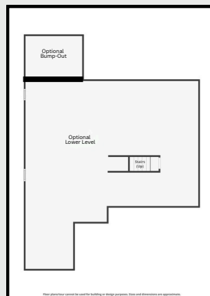
Optional Lower Level