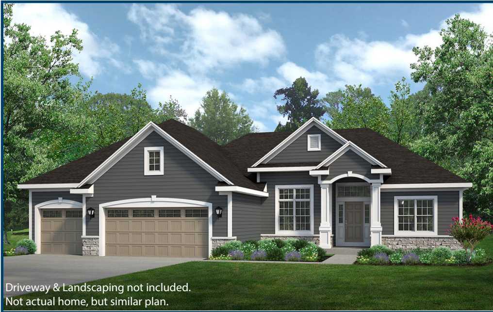
Driveway & Landscaping not included. Not actual home, but similar plan.