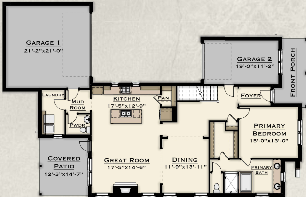
Main Level B