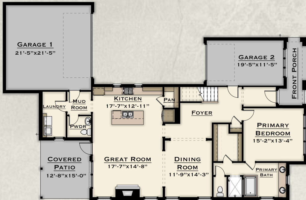
Main Level A