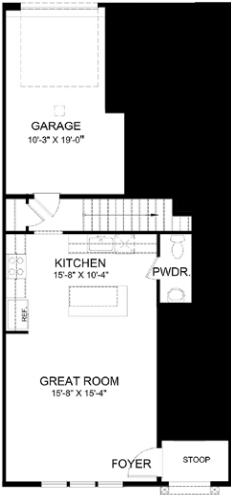
Included First Floor