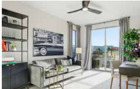
Loft Opens to Balcony