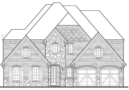
Elevation C with Stone

American Legend Homes reserves the right to change prices, plans, specifications, square footage and availability without prior notice or obligation. Square footages are approximate and may vary upon elevations and/or options selected. Elevations depicted are an artist's rendering and are subject to change or modification without notice. Not responsible for typographical errors. Please see a Sales Associate for more information. American Legend Homes and the ALH logo are registered trademarks of American Legend Homes, LLC. © 2020 American Legend Homes. All rights reserved. Plan 1634_11/18/22