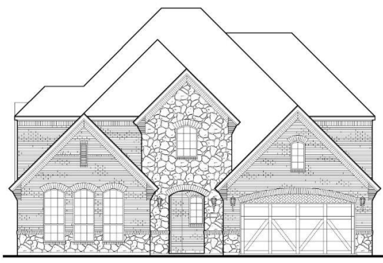
Elevation A with Stone