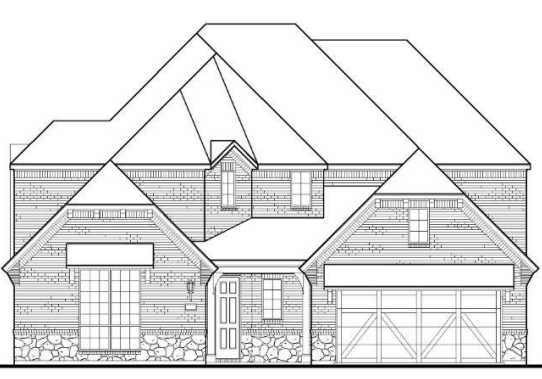
Elevation B with Stone