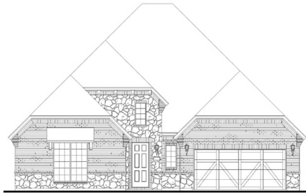
Elevation B with Stone