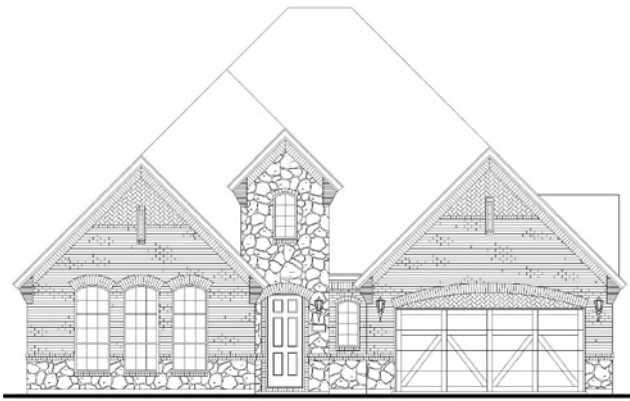
Elevation A with Stone