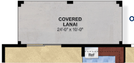
Optional Extended Covered Lanai (#00076)