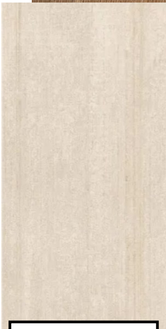
TILE FLOOR @ PRIMARY