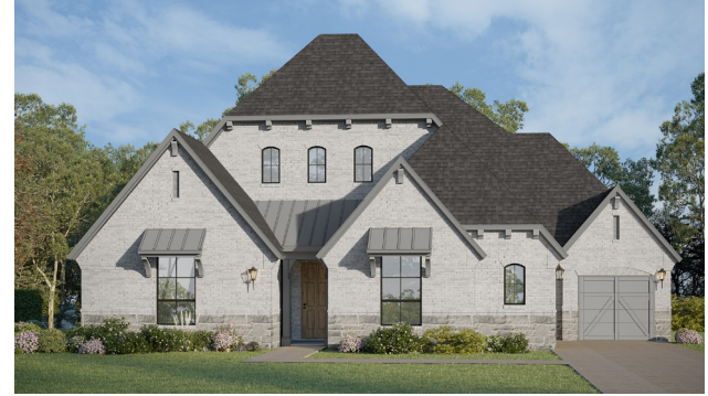
Elevation C with Stone