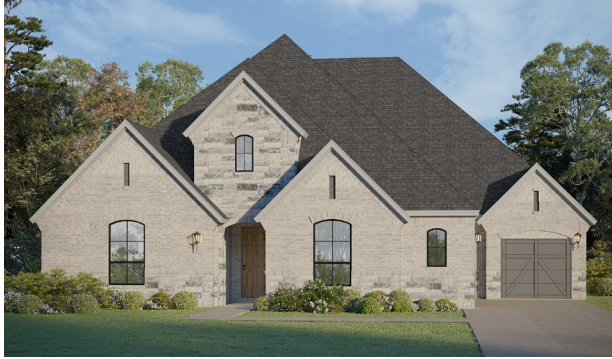
Elevation A with Stone