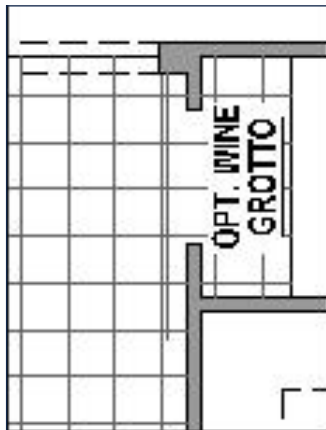
Wine Grotto ILO Coat Closet