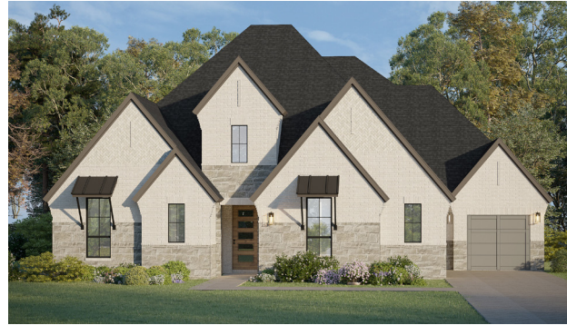
Elevation D with Stone

American Legend Homes reserves the right to change prices, plans, specifications, square footage and availability without prior notice or obligation. Square footages are approximate and may vary upon elevations and/or options selected. Elevations depicted are an artist's rendering and are subject to change or modification without notice. Not responsible for typographical errors. Please see a Sales Associate for more information. American Legend Homes and the ALH logo are registered trademarks of American Legend Homes, LLC. © 2026 American Legend Homes. All rights reserved. Plan 826.ABCD_06/01/26