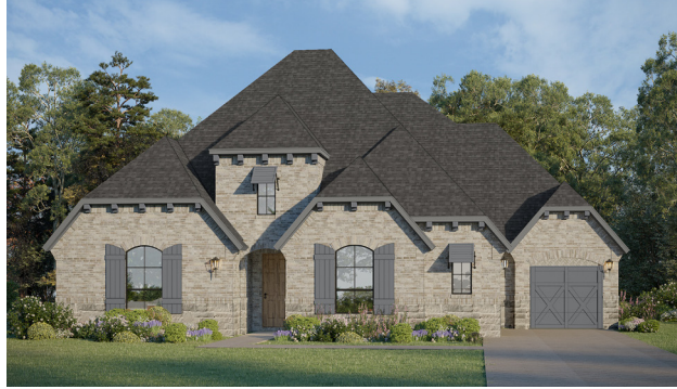
Elevation B with Stone