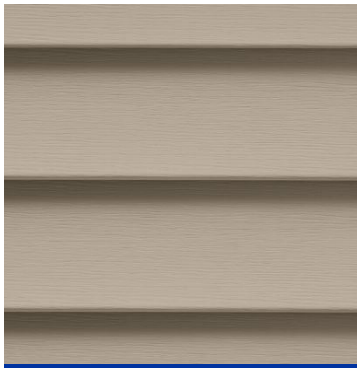
Siding: Natural Clay