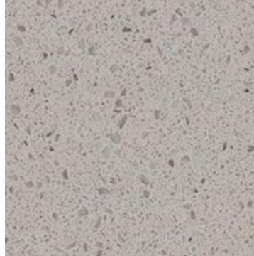
Kitchen Countertops: Granite - Simply Gray