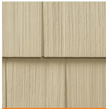
Shake Siding: Savannah Wicker