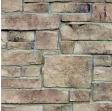
Fireplace Masonry: Stillwater LedgeStone