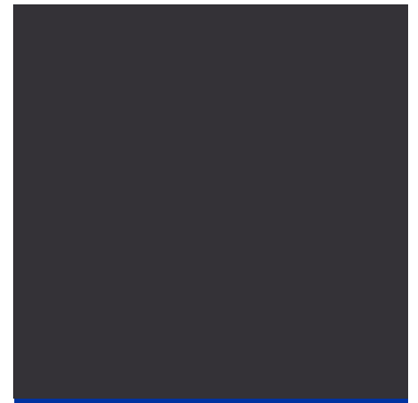
Front Door: SW6989 Domino