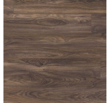
Flooring: InHaus Laminate - Gunstock Oak