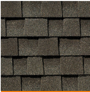
Roof Shingles: Weathered Wood