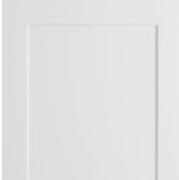
Cabinetry: Birch - White