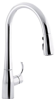
Kitchen Plumbing: Kohler Simplice Chrome

Home elevation renderings and color selection sample images are for illustration purpose only. Digital representation of colors may vary from the actual product. Price accurate as of 09/04/2025. Builder reserves the right to make changes without notice.