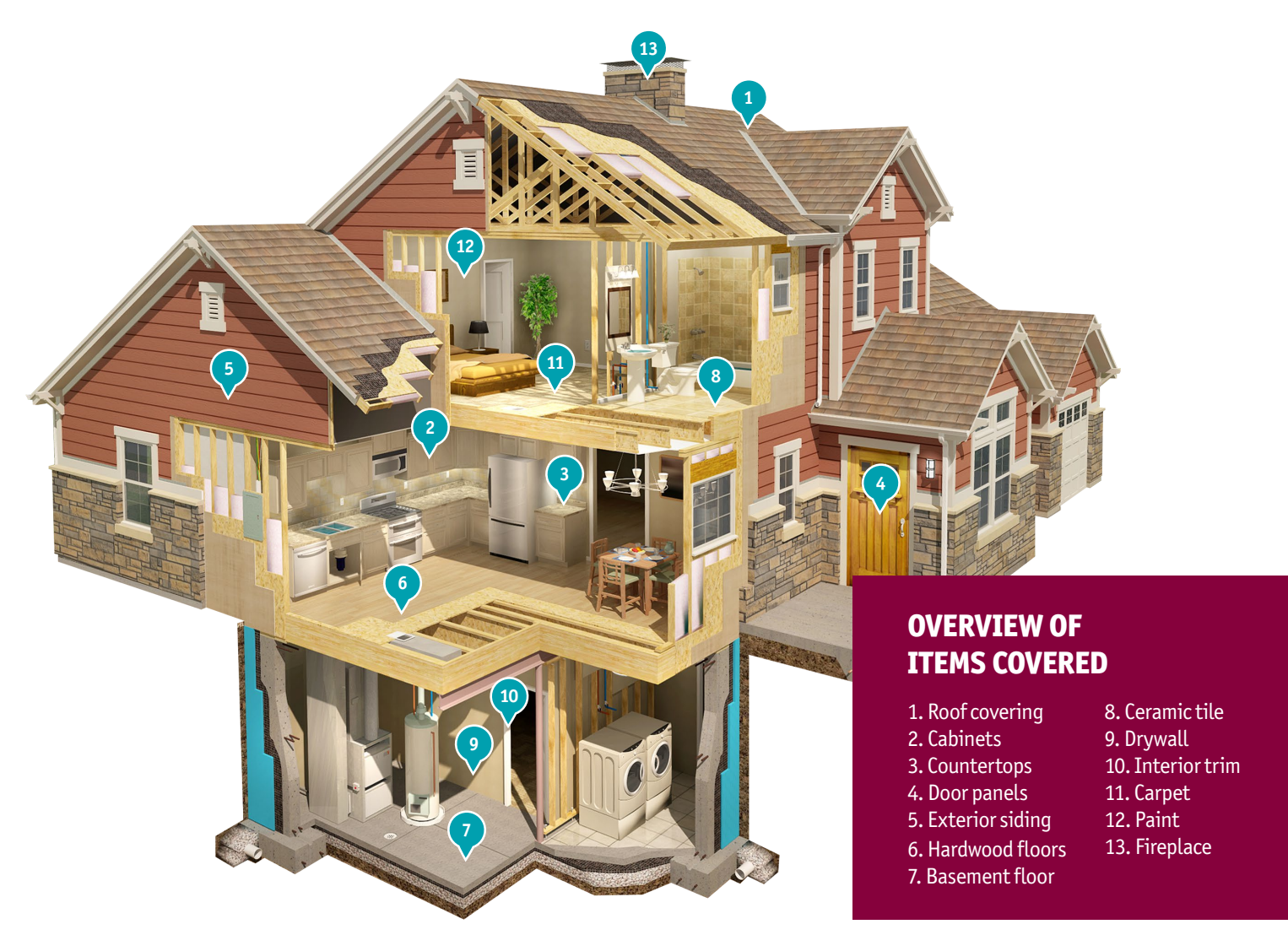
Note: Your home may not have a basement

Your workmanship warranty addresses the fit, finish and materials used in the construction of your home and provides protection against defects throughout the warranty term. An overview of the items covered by your workmanship warranty is illustrated below. For additional information about your workmanship warranty, please review Section VIII – Construction Performance Guidelines .