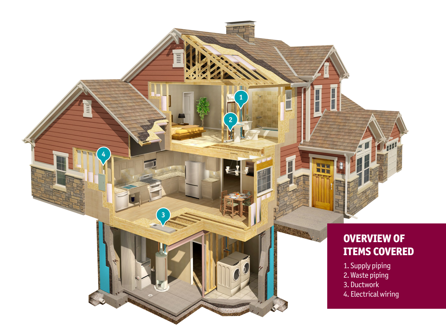
Note: Your home may not have a basement

Your distribution systems warranty provides protection against defects to the means by which electrical, plumbing and mechanical functions are delivered throughout your home during the warranty term . An overview of the items covered by your distribution systems warranty is illustrated below. For additional information about your distribution systems warranty, please review Section VIII – Construction Performance Guidelines .