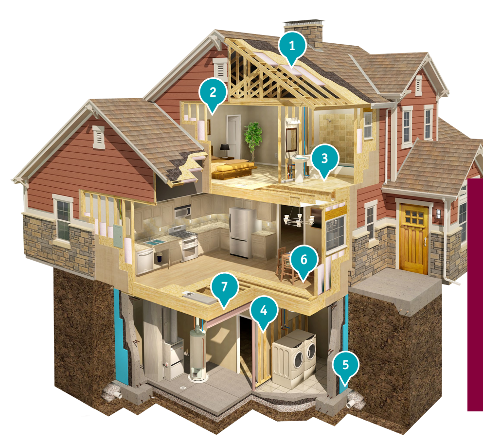
Note: Your home may not have a basement