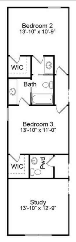
JACK & JILL BATHROOM BETWEEN BEDROOMS 2 & 3