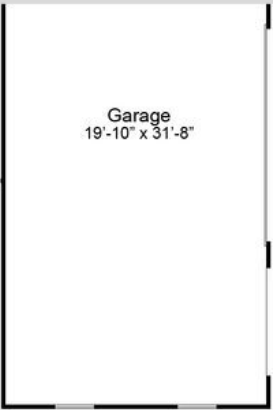
3RD CAR GARAGE