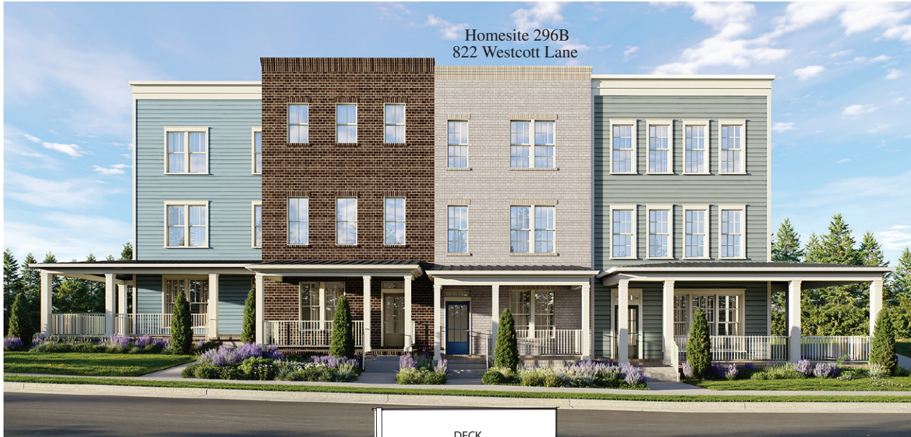
Homesite 296B 822 Westcott Lane