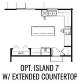
OPT. ISLAND 7' W/ EXTENDED COUNTERTOP