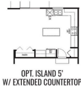
OPT. ISLAND 5' W/ EXTENDED COUNTERTOP