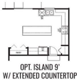
OPT. ISLAND 9' W/ EXTENDED COUNTERTOP