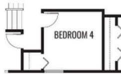
OPT 4 BEDROOM ILO LOFT