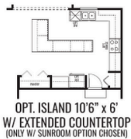
OPT. ISLAND 10'6" x 6' W/ EXTENDED COUNTERTOP (ONLY W/ SUNROOM OPTION CHOSEN)