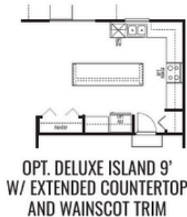
OPT. DELUXE ISLAND 9' W/ EXTENDED COUNTERTOP AND WAINSCOT TRIM