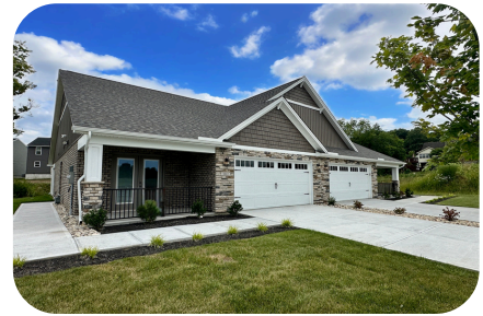
5017 Waterford Lane