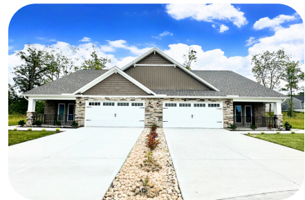
5019 Waterford Lane