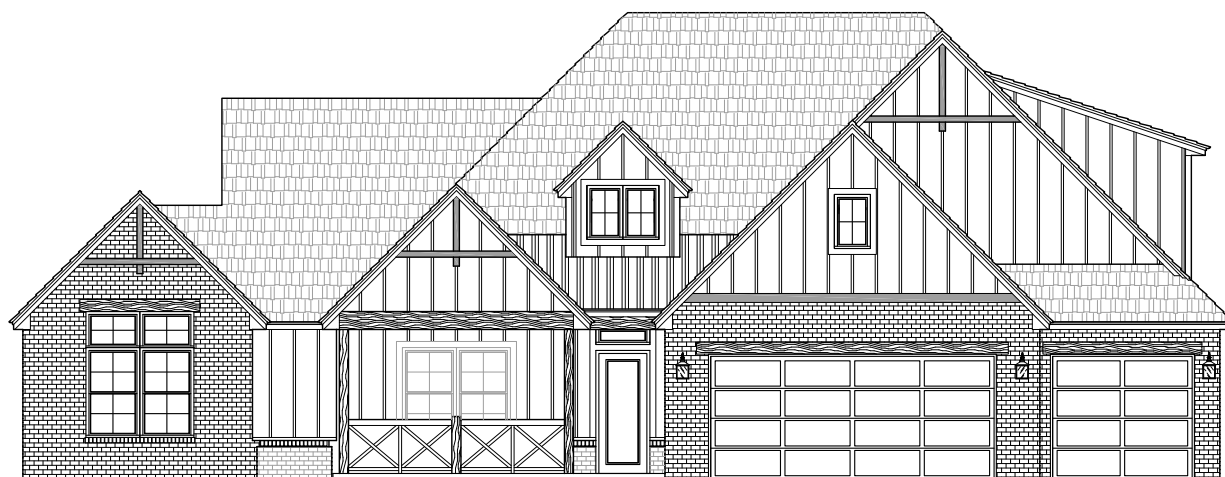
MODERN FARMHOUSE ELEVATION