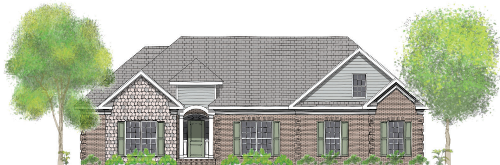
Elevation B Optional Stone Shown