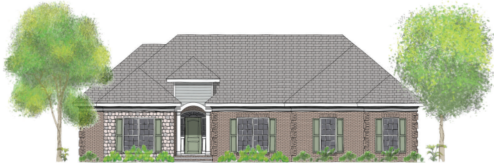
Elevation A Optional Stone Shown