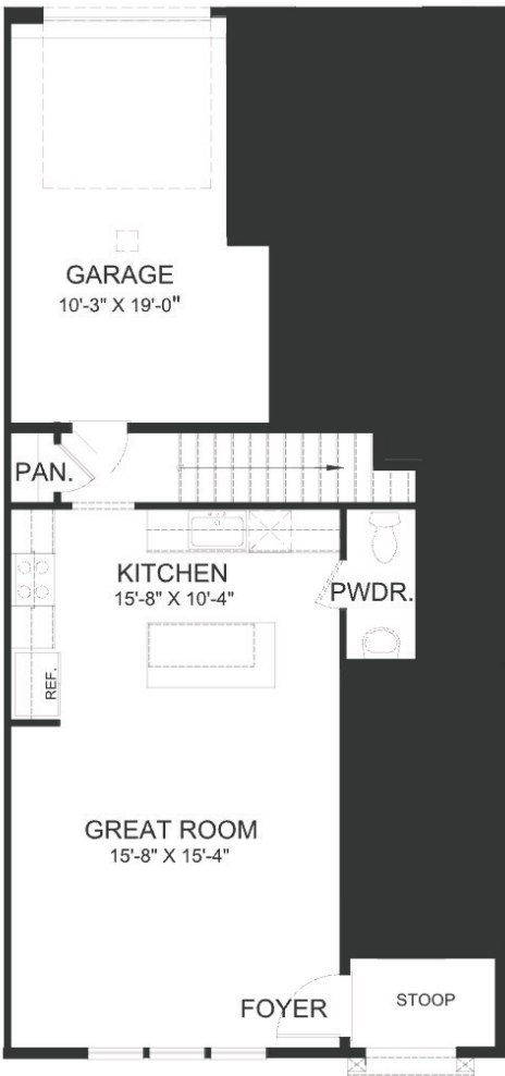
Included First Floor