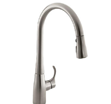
Kitchen Plumbing: Kohler Simplice Vibrant Stainless

Home elevation renderings and color selection sample images are for illustration purpose only. Digital representation of colors may vary from the actual product. Price accurate as of 08/26/2025. Builder reserves the right to make changes without notice.