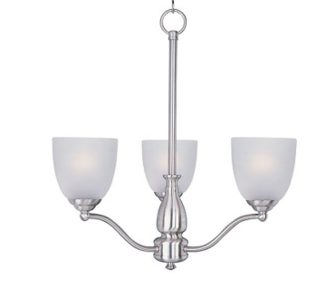
Lighting: Maxim Stefan Collection Brushed Nickel