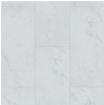
Bathroom Flooring: LVT- Bianco Marble