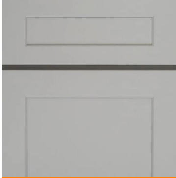
Cabinetry: Birch - Ashen