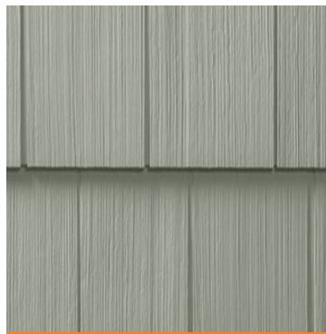
Shake Siding: Seagrass