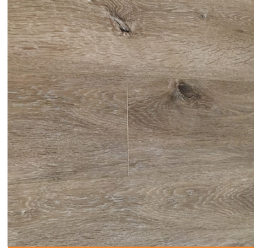
Flooring: Inspired LVP- Bridgewood