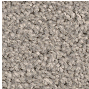
Carpet: Dwellings Groundwork - Silver Birch

Home elevation renderings and color selection sample images are for illustration purpose only. Digital representation of colors may vary from the actual product. Price accurate as of 08/26/2025. Builder reserves the right to make changes without notice.