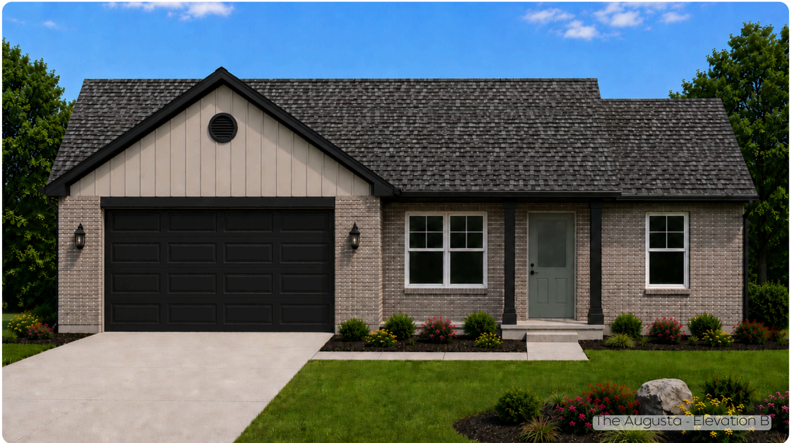
The Augusta - Elevation B