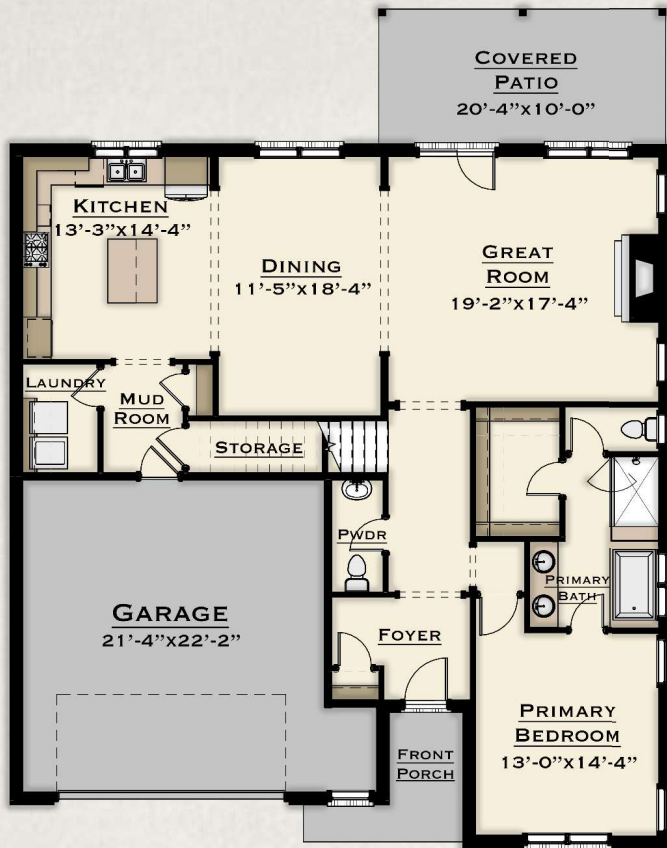
Main Level B