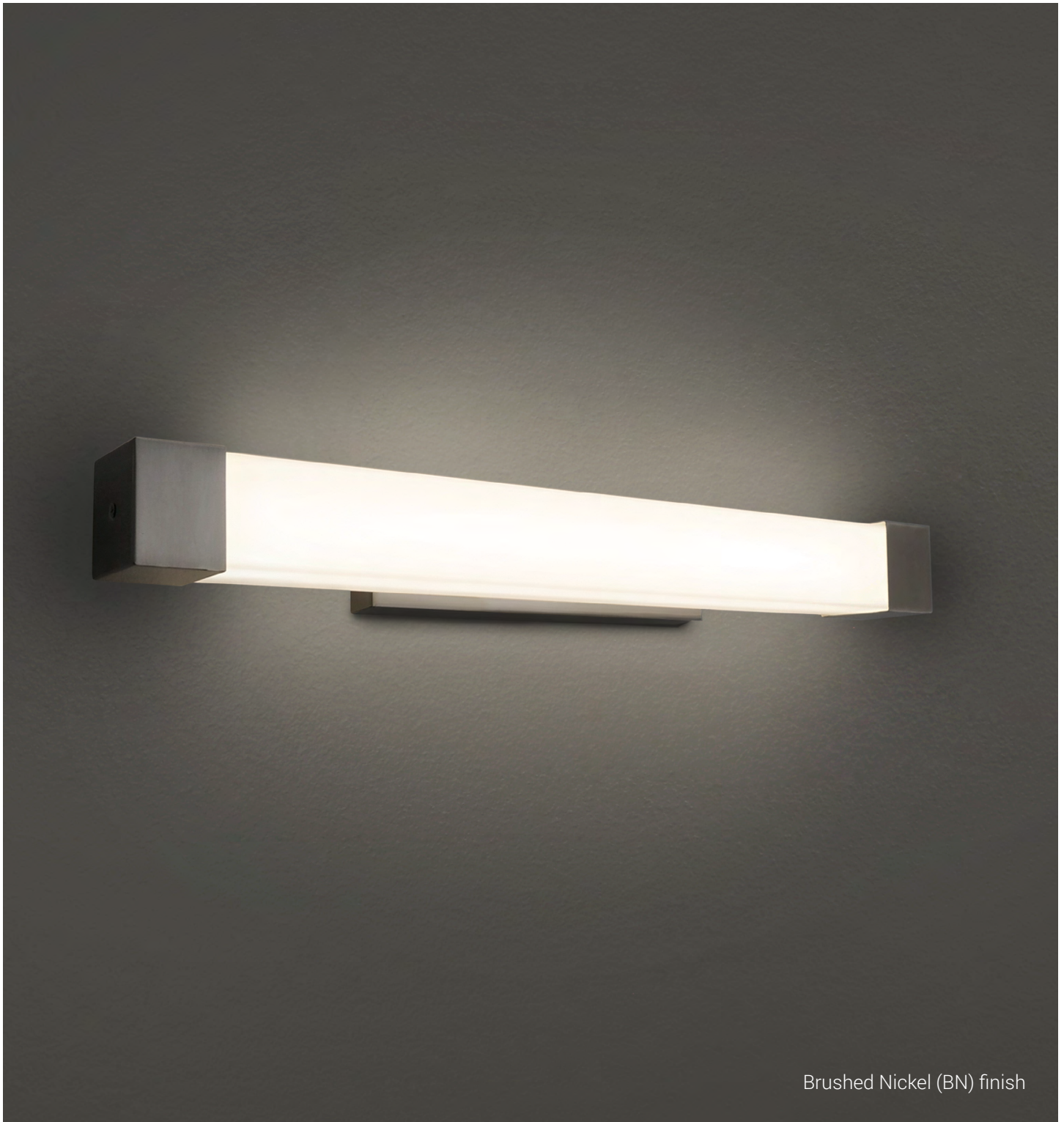
Brushed Nickel (BN) finish