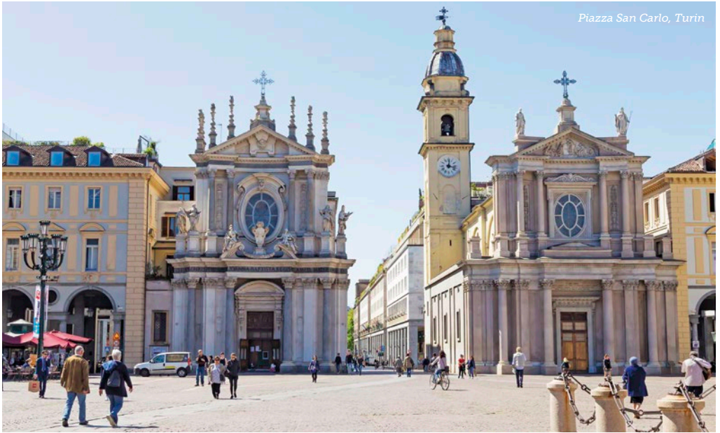
Piazza San Carlo, Turin