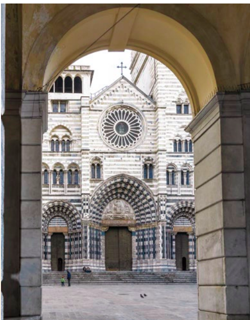
Cathedral of San Lorenzo, Genoa