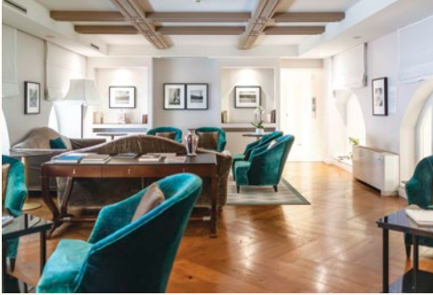
Turin Palace Hotel | Turin

Our travel experts have carefully selected these intimate, first-class hotels for their optimal locations and the superior quality of their amenities. Blending sophisticated style and comfort, the spacious and light-filled guest rooms offer a calm, relaxing environment in which to unwind each night. Receive a warm welcome from the professional staff, who provide pleasant, thoughtful and attentive service to ensure that your stay is truly exceptional.