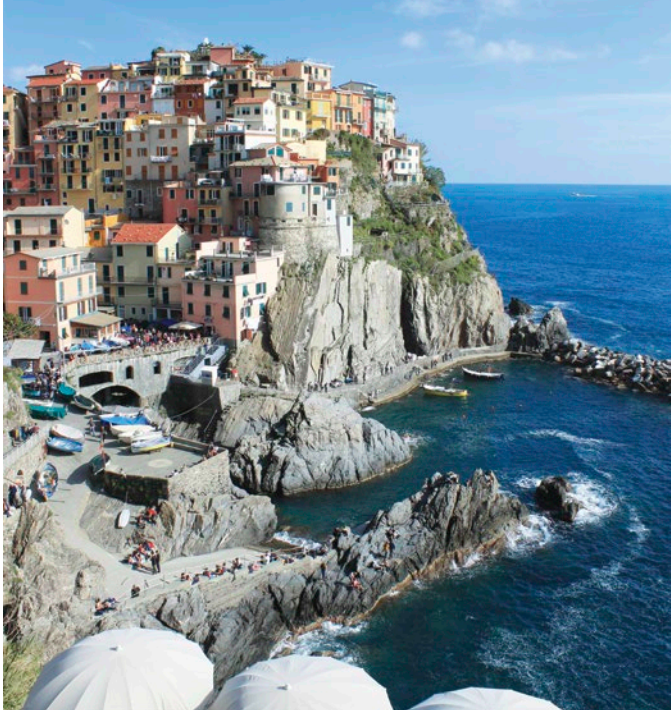
Manarola, Cinque Terre