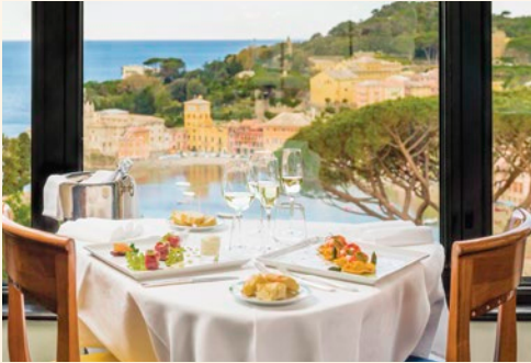
Hotel Vis à Vis | Sestri Levante