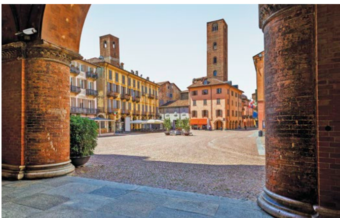
Above: Piazza Risorgimento, Alba | Below: Portofino