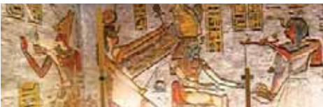
Hieroglyphics, Valley of the Kings

Cooperating Councils: AKRON ♦ ALABAMA ♦ ALASKA ♦ ARIZONA ♦ ATLANTA ♦ AUSTIN ♦ BALTIMORE ♦ BOSTON ♦ BUFFALO ♦ CHARLESTON ♦ CHARLOTTE ♦ CHICAGO ♦ GREATER CINCINNATI ♦ CLEVELAND ♦ COLORADO SPRINGS ♦ COLUMBUS ♦ CONNECTICUT ♦ DALLAS-FORT WORTH ♦ DAYTON ♦ DENVER ♦ GREATER HAMPTON ROADS ♦ HARRISBURG ♦ HILTON HEAD ♦ HOUSTON ♦ INLAND SOUTHERN CALIFORNIA ♦ JACKSONVILLE ♦ KANSAS CITY ♦ KENTUCKY/SOUTH INDIANA ♦ LAS VEGAS ♦ LOS ANGELES ♦ MAINE ♦ MIAMI ♦ MID-HUDSON VALLEY ♦ MILWAUKEE ♦ MONTANA ♦ MONTEREY BAY ♦ NAPLES ♦ NEW ORLEANS ♦ NEW HAMPSHIRE ♦ NORTHERN CALIFORNIA ♦ ORANGE COUNTY ♦ OREGON ♦ PALM BEACH ♦ PEORIA ♦ PITTSBURGH ♦ GREATER READING ♦ RHODE ISLAND ♦ RICHMOND ♦ SAN ANTONIO ♦ SAN DIEGO ♦ SANTA FE ♦ SAVANNAH ♦ SEATTLE ♦ SONOMA COUNTY ♦ SOUTH TEXAS ♦ ST. LOUIS ♦ STAMFORD ♦ TACOMA ♦ TENNESSEE ♦ TRAVERSE CITY ♦ UTAH ♦ VERMONT ♦ WESTERN COLORADO ♦ WESTERN MICHIGAN ♦ WESTERN NORTH CAROLINA