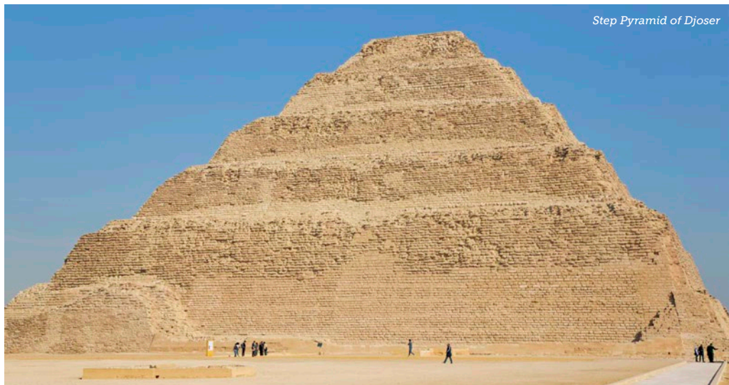
Step Pyramid of Djoser