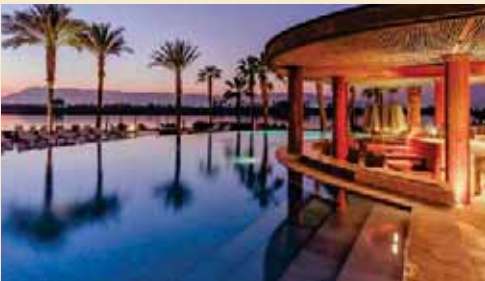
Hilton Luxor Resort & Spa | Luxor