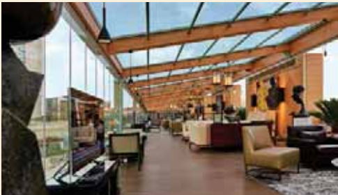
Four Seasons Hotel Cairo at Nile Plaza | Cairo