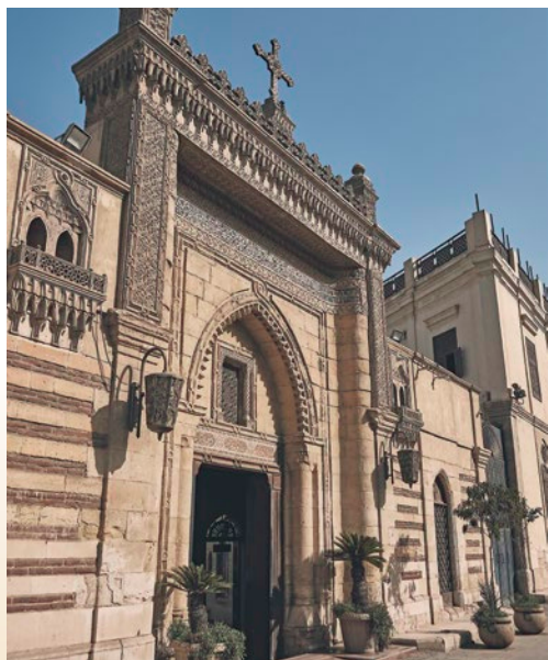
Hanging Church, Cairo

After breakfast, check out of the hotel.