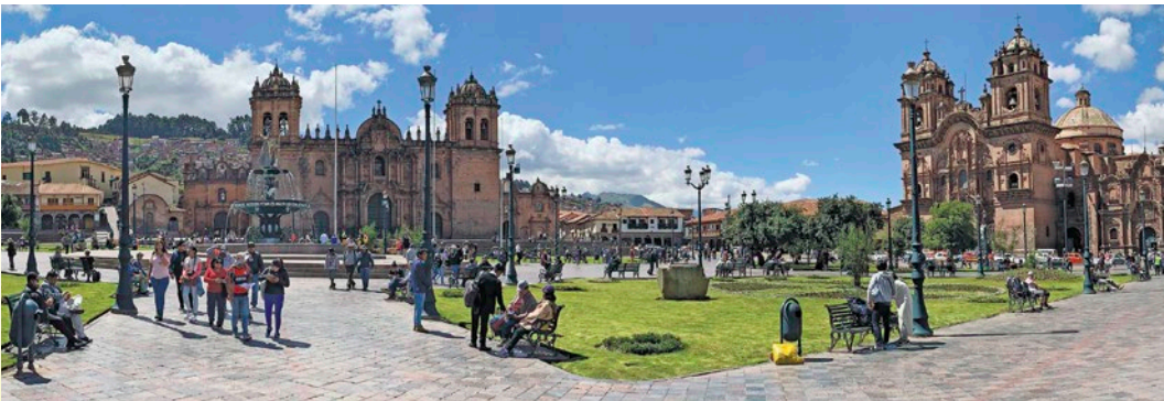
Plaza de Armas, Cusco

Set out aboard skiff boats, anticipating the day's astounding and unexpected wildlife encounters. Pacaya Samiria National Reserve, where the ship cruises, is one of Peru's largest wildlife preserves with more than five million acres of rich biodiversity. Marvel at gray and pink dolphins and watch for toucans and macaws hiding in the rain forest.