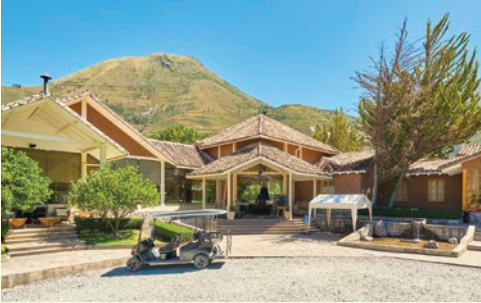
Casa Andina Premium Valle Sagrado | Sacred Valley