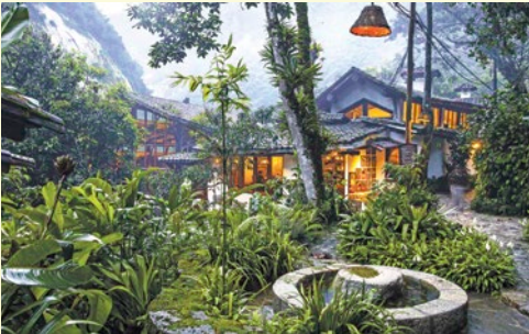
Inkaterra Machu Picchu Pueblo | Machu Picchu