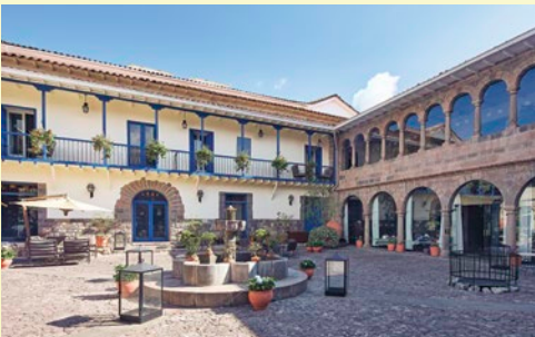
Palacio del Inka | Cusco