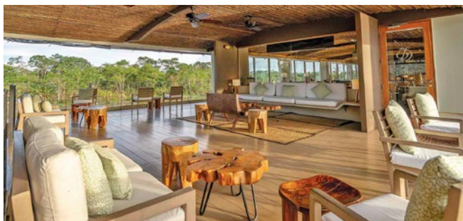
Delfin III covered deck

Please note: Program-specific terms and conditions are available at https://worlda.ahitravel.com/destinations/2000A?schoold=235 .