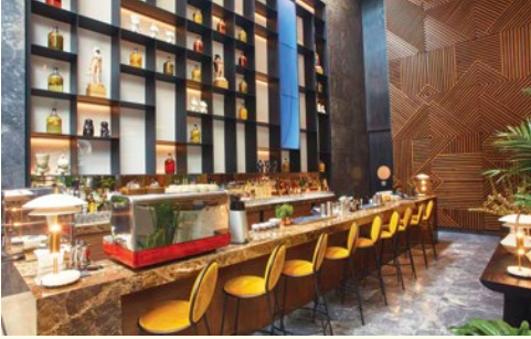
Pullman Lima Miraflores | Lima