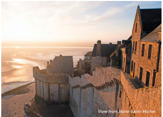
View from Mont-Saint-Michel