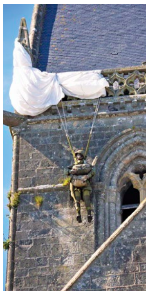
Private John Steele Monument, Sainte-Mère-Église

Knowledgeable Lecturers deepen your appreciation for the region and its history, culture and current events.