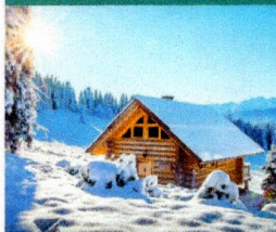
Low Income Home Energy Assistance Program

The Low Income Energy Assistance Program (LIHEAP) helps eligible individuals and families pay part of