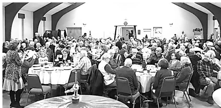
{The Fellowship Hall at Mount Pleasant filled with people on the night of the Special December Christmas Event with the musical group, Sunday Drive.}