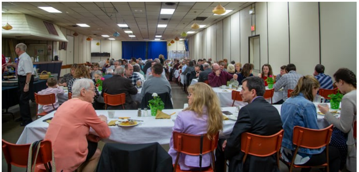
A good crowd enjoyed the roast beef dinner prepared by the Legion Ladies. And even with pie for desert, the Anniversary Cake was enjoyed as well!