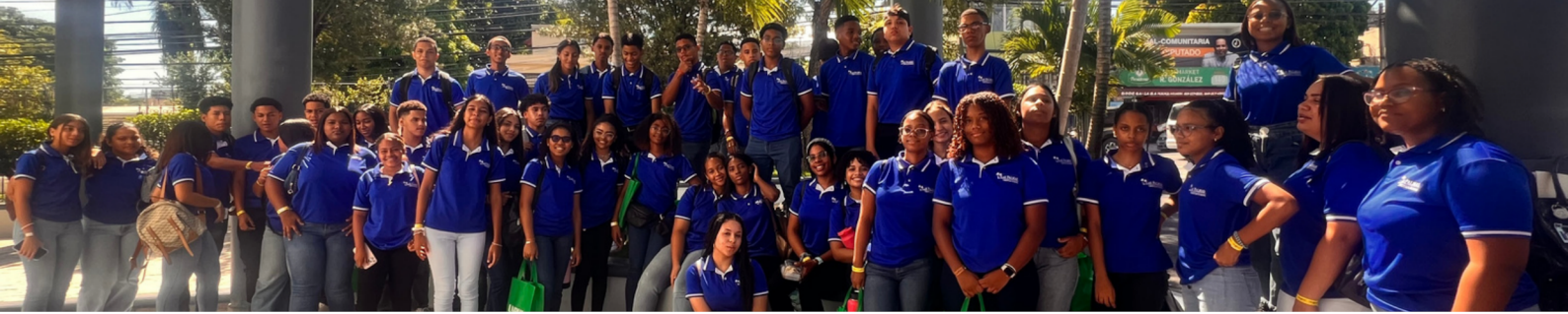
12th & 11th Graders attending a CHOICES career conference.