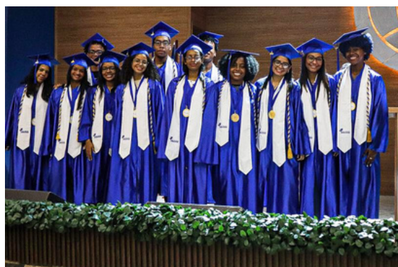
Seniors that graduated Summa Cum Laude Picutre by JT