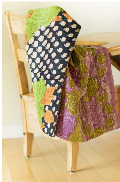
Small throw $56.00

Be sure to check out their display, either at the church or on the Zoom broadcast! There will be Christmas ornaments, scarves, small throw blankets and quilts, baby items, etc.