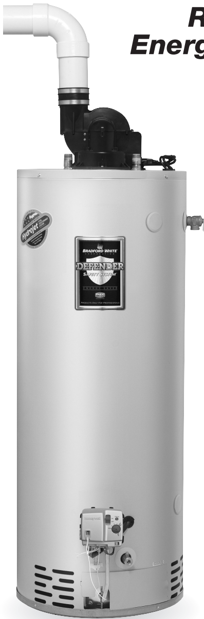
Photo is of M-2-TW-50T6FBN