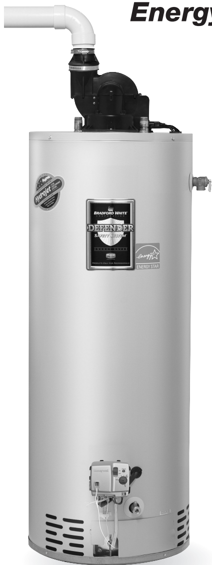
Photo is of M-4-TW-40T6FBN