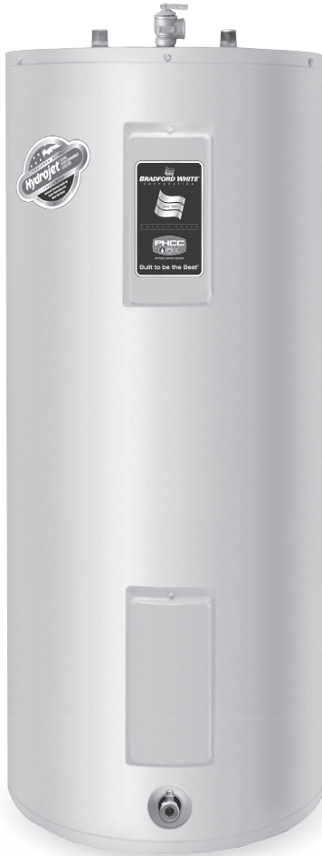
Photo is of RE250S6