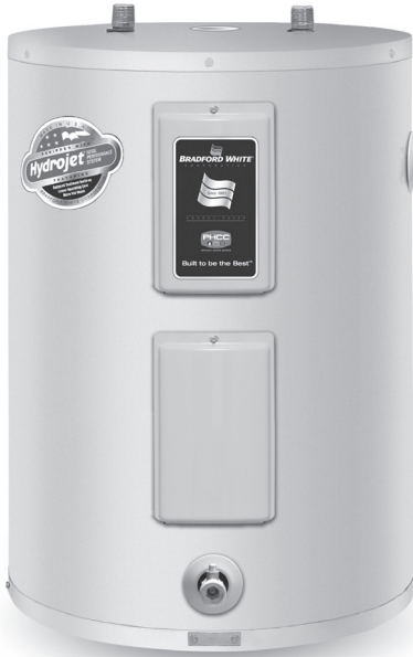
Photo is of M-1-20L6DS