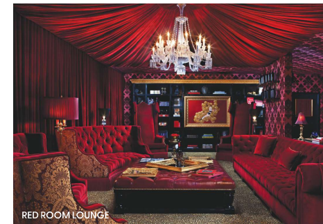
RED ROOM LOUNGE

Learn more at raymondvineyards.com/events