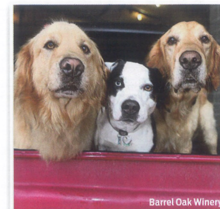
Barrel Oak Winery